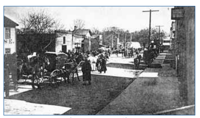
Horse Market Days, circa 1890, Chicago Ave., looking east from Main Street.

goods store, with dances and social gatherings held in a hall on the third floor.